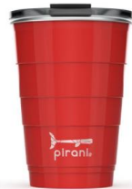
Pirani Party Tumbler