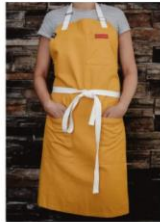
Sustainable Fabric Handmade Apron