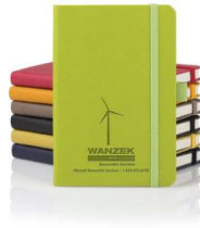
Apple Peel Paper Journal - Small