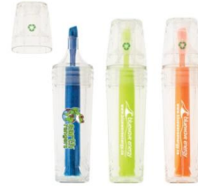
Recycled Plastic Highlighter