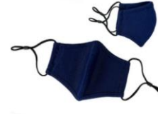
Adjustable Cotton Spandex Face Mask