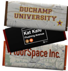
Spectrum Bakes Granola Bars