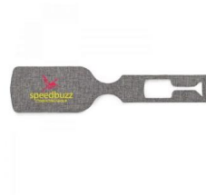
100% Recycled Aqua Luggage Tag