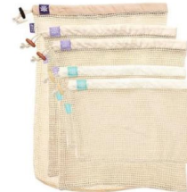
Reusable Organic Cotton Mesh Produce Bags