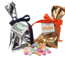
Candy Gift Bag