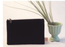
Sustainable Fabric Zip Pouch - Various Sizes