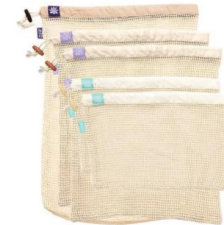
Reusable Organic Cotton Mesh Produce Bags