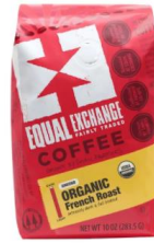
Organic Fair Trade French Roast